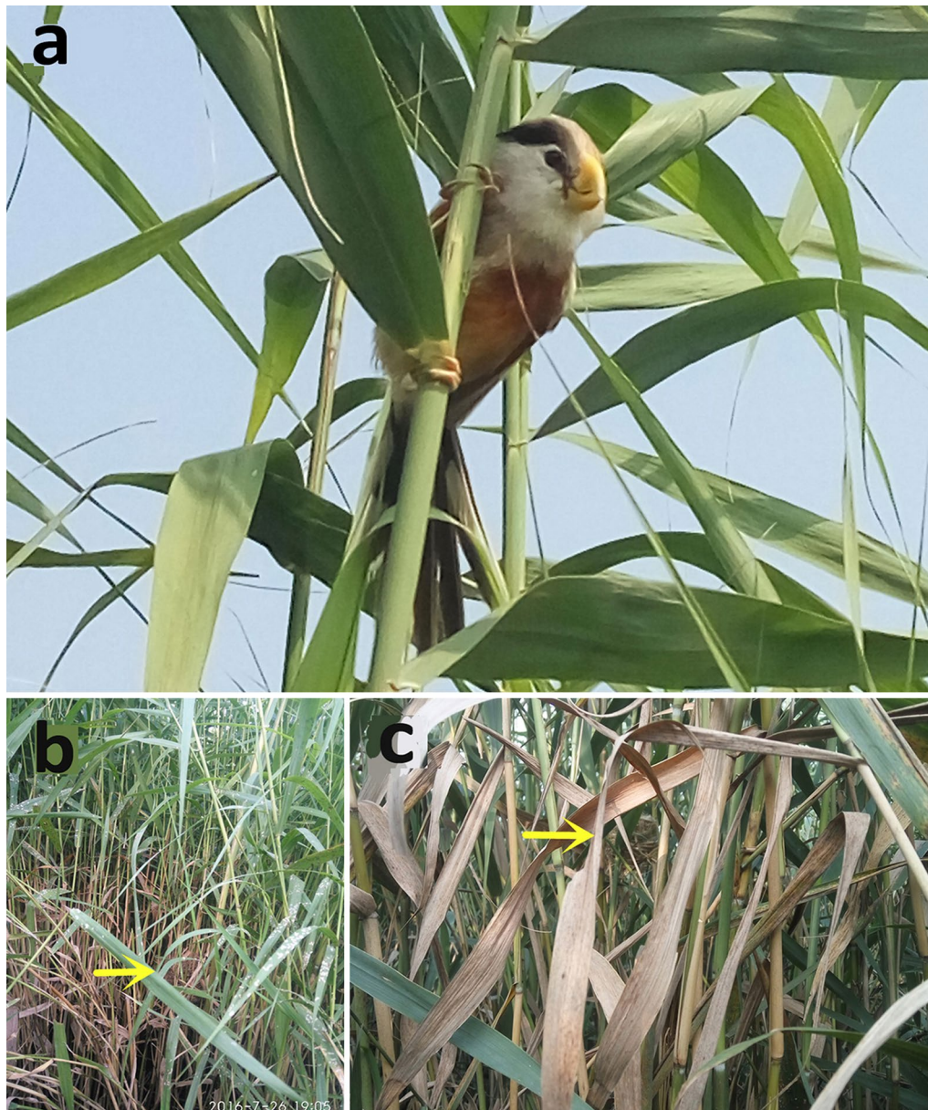
Fig. 1 The Reed Parrotbill ( Paradoxornis heudei ) (a) and its nest in the reed habitat before (b) and after a flooding event (c)

to the nearest reed edge; (3) distance to water edge: the distance from the nest-site to the nearest body of water; and (4) distance to perch: distance from the nest-site to the nearest perch that a predator could use to observe the nest.