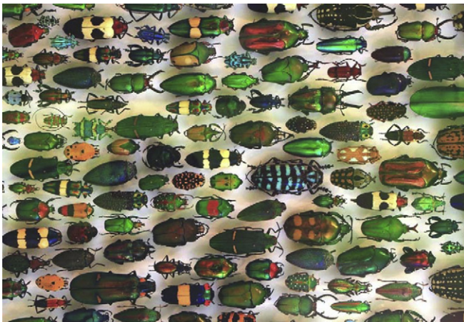
Fig. 1 A set of insects with a variety of patterns and iridescent colors issued from the State Museum of Natural History in Karlsruhe, Germany.