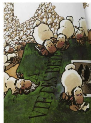
Fig. 2 The milking of woolly aphids, as cited by Boris Vian in Les Fourmis (Gallimard, La Pléiade) and reported on the left, with a possible representation on the right: Le Génie des alpages , F.Murr, Casterman.

Boris Vian, Les fourmis (Gallimard 2010 Ouvres romanesques complètes p.55)