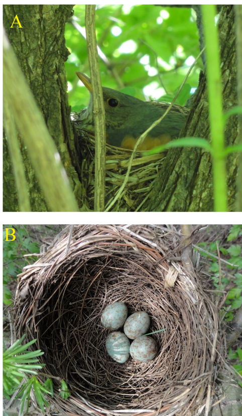
Figure 1 Nest site, nest, incubating female, and eggs of the grey-backed thrush

with short ground cover and a high density of small trees and shrubs (Zhou et al., 2011). In our study site, open-cup nests were built in trees (Figure 1A), and pale green eggs with reddish markings were laid in these nests. (Figure 1B), with an average clutch size of 4.42 \text{ eggs} \pm 0.51 (range 4–5 eggs, n=12 ).