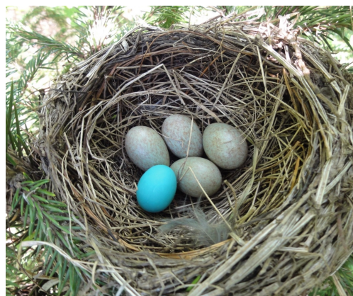
Figure 2 Experimental nest of the grey-backed thrush with a blue model egg

potential nest sites and monitoring the activity of reproductive adults. Nests were then randomly sorted into two groups: (1) manipulated group into which one immaculate blue model egg was introduced just after clutch completion ( n=12 ) (Figure 2); and (2) control group in which nests were visited by the same procedure to control for human disturbance, but no manipulation was made ( n=10 ). Manipulation was performed in these circumstances without observing hosts to avoid potential effects of host observations on recognition (Hanley et al., 2015). Observed nests were monitored for 6 d after manipulation and the responses of thrushes to foreign eggs were classified as rejection, if foreign eggs were ejected, pecked, or deserted, or accepted if foreign eggs were intact and incubated (Yang et al., 2010, 2014b). Model eggs were made by polymer clay and their sizes were standardized to 25 \text{ mm} \times 19.5 \text{ mm} , similar to thrush eggs ( 25.07 \pm 0.42 \text{ mm} \times 19.74 \pm 0.71 \text{ mm} , n=10 ).