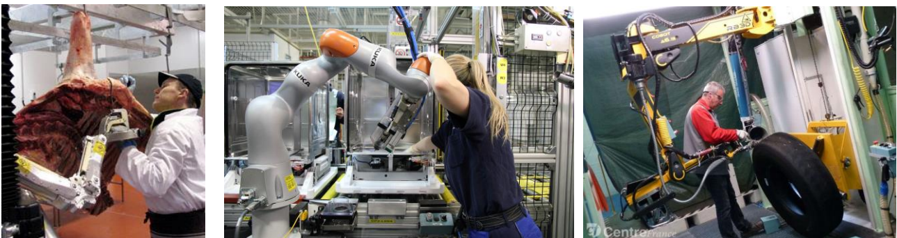
Figure 1: Examples of collaborative robots for industrial applications. Left: HookAssist (Kinea Design) for beef boning. Center: Lightweight robot (KUKA). Right: Cobot 7A.15 (RB3D) for tire retreading.

Work-related musculoskeletal disorders (WMSDs) are the first cause of occupational diseases in developed countries (Schneider, 2010; Parent-Thirion, 2012; US Department of Labor, 2016). They represent a major health issue and a significant cost for companies. WMSDs develop when biomechanical demands at work repeatedly exceed workers' physical capacity (Punnett, 2004). Despite growing automation, numerous strenuous tasks cannot be fully automatized, at all or at a reasonable cost. With the increase of product variants built at the same assembly line associated to small order sizes, human flexibility and cognitive skills remain needed. In such situations, collaborative robotics has the potential to reduce workers exposure to WMSDs risk factors, while keeping them in control of the task execution (Krüger, 2009; Schmidtler, 2015). Collaborative robotics takes multiple forms, from shared workspace, where a human and a robot work side-by-side without physical separation, to direct physical interaction where a human and a robot cooperatively work on a common task (co-manipulation, Fig. 1). Specifically, co-manipulation robots can provide a variety of benefits, such as strength enhancement, weight compensation or movement guidance (Colgate, 2003).