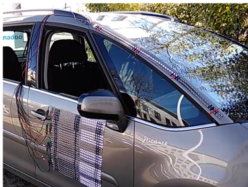
Figure 1: 3D simulation, design and prototype of our external Human-Machine Interface for autonomous car.