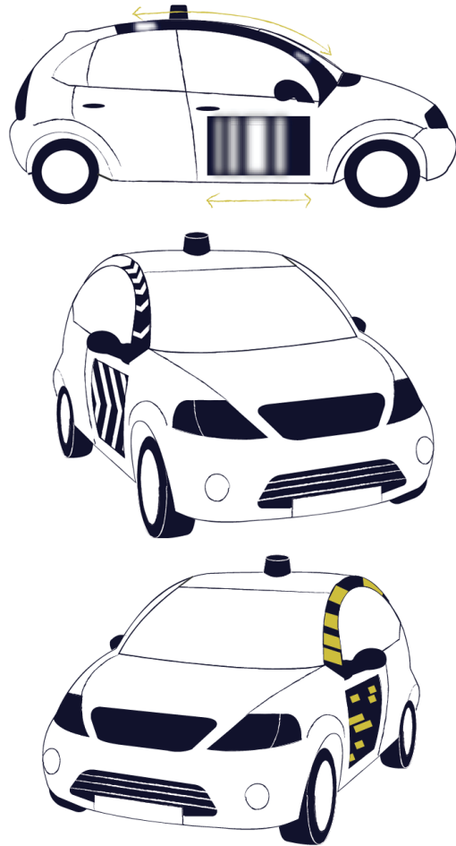
Figure 3: Thoughts on using lateral surfaces to express car speed through animated coloured patterns.