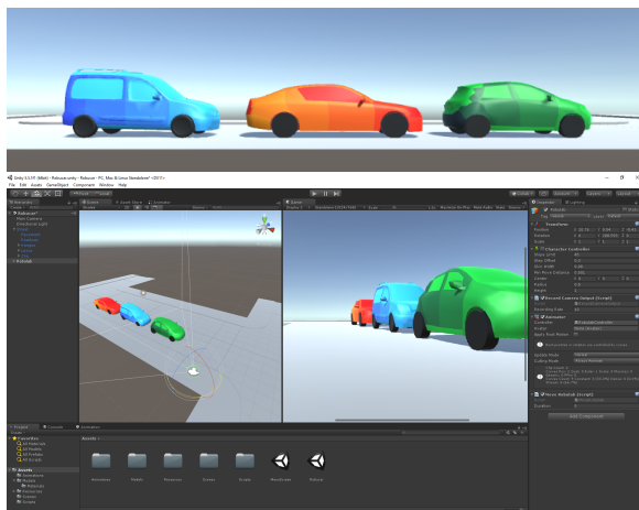
Figure 2: 3D simulation framework. At top, a side view of the 3 cars. At bottom, the scene setup in Unity3D including the visualization and images generation parts. The simulator handles pedestrian simulated trajectories and point of views. Usage of a flat color shader to generate the images allows to easily segment and identify the visible parts of each car.

We carried out an experiment to study the optimal position of the display, i.e. the position maximizing its visibility in all conditions to ensure maximum feedback for pedestrians and to increase safety. First, using a 360° camera, we simulated the point of view of a pedestrian crossing in front a several cars. After analysing the videos, we concluded that that positioning the eHMI optimally is not