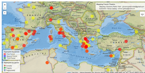
Figure 5: Pierre Corneille (yellow) and Rotrou (red).

When comparing the use of place names mentioned by author, it also appears that some authors, like Molière or Du Ryer, do not use geography as a stylistic marker (fig. 4), while others make an intensive use of it (fig. 5).