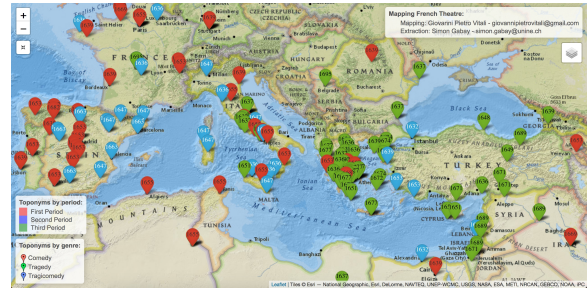
Figure 3: Comédies (red), tragédies (green), tragi-comédies (blue).

It seems that there is a very clear generic distribution of places, with Italy as a shared border. Tragédies are located east, comédies west, and tragi-comédies both east and west (fig. 2).