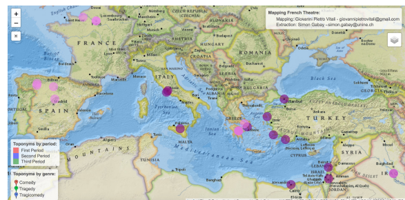
Figure 4: Molière (pink) and Du Ryer (purple).

This reveals the strong impact of Spanish Golden Age theatre on comédies , and of the classical and the biblical world on tragédies . Tragi-comédies , as its name suggests, appears as a truly intermediary genre, not leaning in either direction.