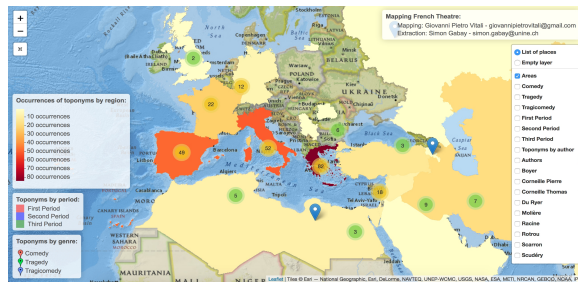
Figure 1: the final map.

A selector on the right allows the user to choose what he wants to display, and a map legend on the left provides basic information for understanding the results.