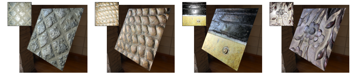
Figure 1: Re-renderings of materials captured using a single flash picture (top-left) and our deep acquisition method.

Valentin Deschaintre Université Côte d'Azur, Inria, Ansys, valentin.deschaintre@inria.fr