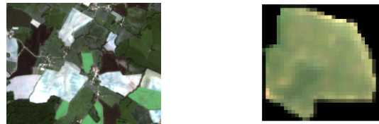
(a) Fragment of tile T31TFM (b) Example of an image patch of Sentinel-2 TOC product. for one observation of a parcel.

All the models are trained for 50 epochs with Adam optimizer [15] set with a batch size of 32 and a learning rate of 10^{-3} . We use 5-fold cross-validation: for each fold the dataset is split into train, validation and test set with a 3:1:1 ratio. The epoch achieving the best results on the validation set is used for performance evaluation on the test set.