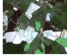
(a) Fragment of tile T31TFM

All the models are trained for 50 epochs with Adam optimizer [15] set with a batch size of 32 and a learning rate of 10^{-3} . We use 5-fold cross-validation: for each fold the dataset is split into train, validation and test set with a 3:1:1 ratio. The epoch achieving the best results on the validation set is used for performance evaluation on the test set.