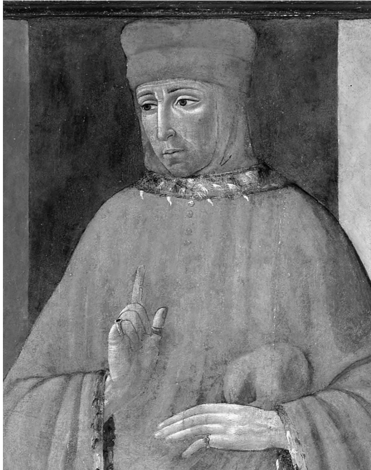
Fig. 1. Detail from a portrait of Francesco di Marco Datini by Tommaso di Piero del Trombetto, 1490.

developed them in Prato (his native town), Pisa, Florence and Genoa. The 1390s saw the deployment of his company's activities throughout the Mediterranean, particularly in the Iberian area with the establishment of subsidiaries in Barcelona, Valencia and the island of Majorca. All the subsidiaries were independent, held together only by Datini himself as the majority partner of each of them. The remarkably rich correspondence preserved in Prato, where Datini died in 1410, comprises three years of the Lorini Company (1391–1394) and seventeen years of the Datini Company (1394–1411). 5 According to instructions in his will, after Datini's death all his businesses were liquidated, but the records and correspondence were to be preserved. It took time, however, to wind up the company's Majorcan activity, which continued into 1411. 6