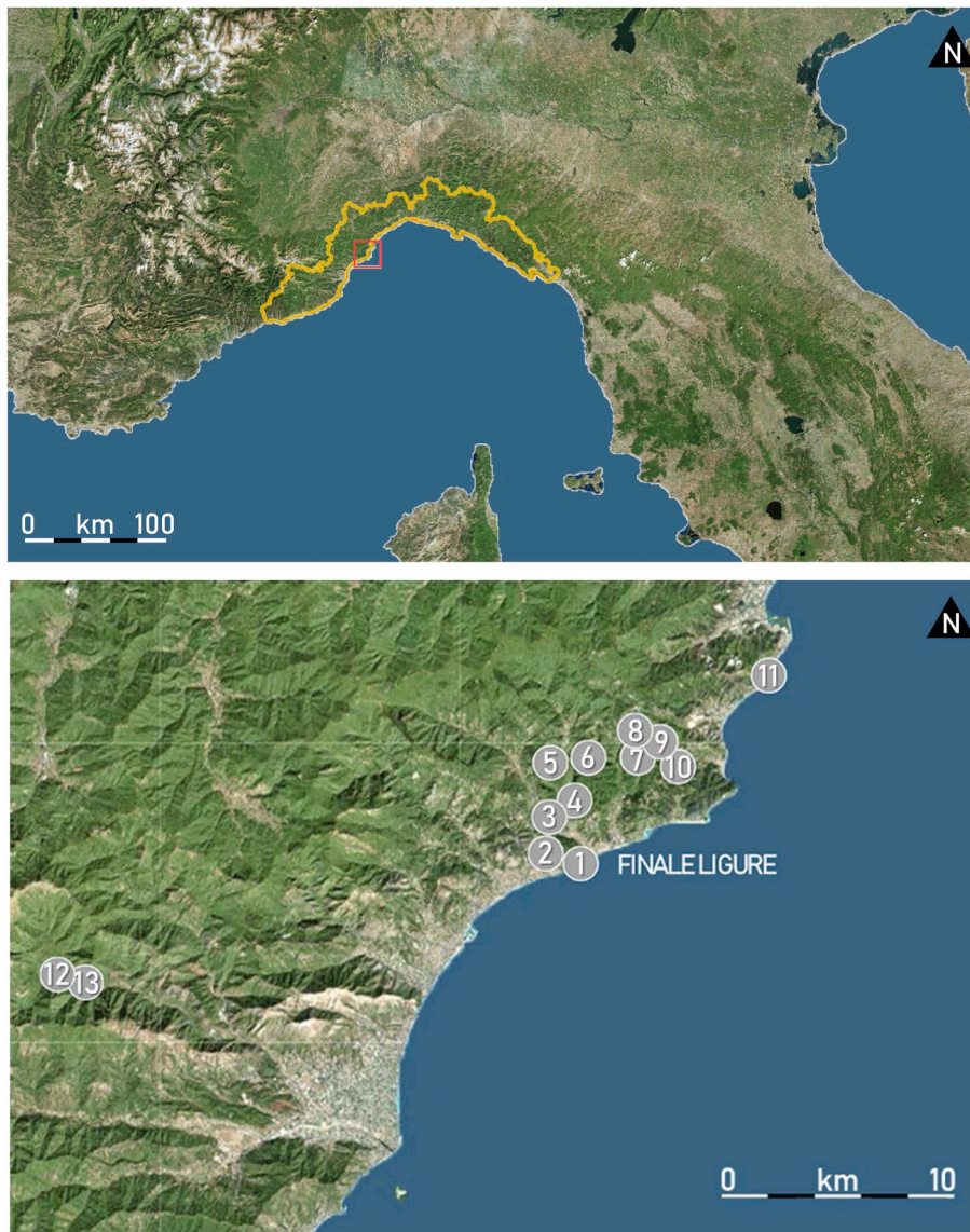
Fig. 1. Top: geographical position of Liguria and the Finalese area in northern Italy and the northwestern Mediterranean. Bottom: The location of the sites included in this study: 1) Arene Candide; 2) Battorezza, Mandurea, Parmorari; 3) Arma delle Anime; 4) Grotta dell'Acqua, Arma del Morto, Caverna della Matta o del Sanguinetto; 5) Pollera; 6) Arma dell'Aquila; 7) Strapatente; 8) Boragni; 9) Pipistrelli; 10) Pian del Ciliegio; 11) Bergeggi; 12) Grotta delle Camere; 13) Arma di Nasino.

human remains. We present here the results of 130 new AMS radiocarbon dates on human remain samples (from burials, individuals reconstructed from disturbed and/or undocumented contexts, and isolated scattered remains) aimed at an initial assessment of the chronology, possible temporal clustering, and chrono-cultural attribution of the skeletal series from western Liguria. The results will also set the bases for several anthropological studies on paleodemography and paleoepidemiology, diachronic changes in diet, habitual activities, life history, and funerary behaviors.