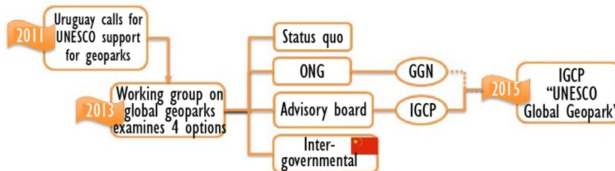
Figure I.3. Diagram of the final stages of negotiations to create the UGG label (source: Du and Girault 2018, p. 12)

In November 2015, at the 38th session of UNESCO's General Conference, the International Geoscience and Geoparks Program (IGMP) approved the creation of a new UNESCO Global Geopark (UGG) label (UNESCO, 38 C/14, 2015) (Figure I.3).