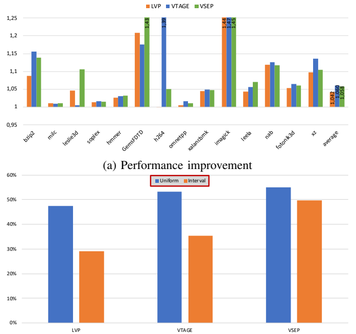
Fig. 2: Comparison of the three prediction schemes: LVP, VTAGE and VSEP.

Figure 2 reports our simulation results by comparing the three different value predictors that we consider. In particular, Figure 2a shows the relative IPC of the three variants nor-