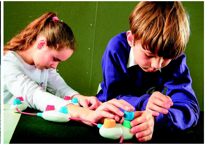
Two children with visual impairments collaborating using Torino, a socially inclusive physical programming language for teaching basic programming constructs and computational thinking skills.

we identified during the CHI 2018 workshop on the design of inclusive educational classroom technology for people with VI [2]. These relate to opportunities and challenges for: 1) inviting connection, 2) promoting people with VI as creative agents, and 3) developing effective assessments of educational technologies at scale. We unpack each of these three topics on which we reflected and shared during the workshop. We present them as the beginnings of a useful rubric to follow when planning inclusive education research. These tactics combine to push back against traditional educational settings for students with disabilities that isolate them. Instead, they intend to facilitate interdependencies among students by inviting connections and to maintain all participants as learners and contributors [3]. As such, they emphasize the participation of all students while attempting to uplift those with disabilities who have been traditionally marginalized [4].