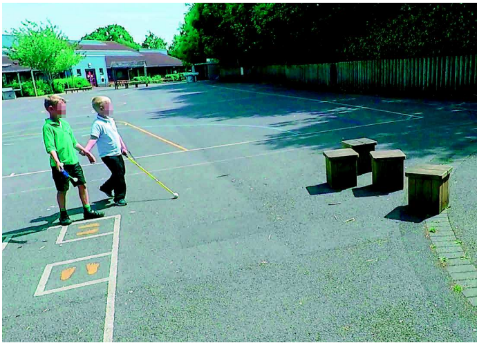
Two school children engaged in the bodystorming activity. The visually impaired child with the cane is guiding their sighted peer with their arm.