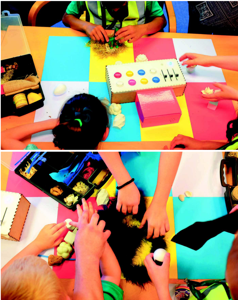
A group of visually impaired and sighted children and their teacher using an inclusive multisensory storytelling toolkit that combines digital audio recording with olfactory display and low-fi crafting.

themselves. This was purposeful; co-design and inclusive education both prioritize collaboration. We intend for this overlap to be a welcome opportunity for designers and educators to share methods. As more students with disabilities spend time in mainstream classrooms, we hope our suggestions guide all educational technology researchers to prioritize accessibility and recruit students with disabilities. And we hope these suggestions serve as the beginning of broader research to design classroom technologies that connect rather than isolate students.