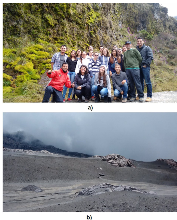
Figure 3. IGCP636 2016 field trip: (a) main researchers and students at Los Nevados natural national park, (b) Valle de Las Tumbas (4300 m a.s.l.), one of the stops where lava and pyroclasts can be observed.