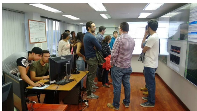
Figure 1. IGCP636 2016 field trip: visit to the volcanological and seismological Observatory in Manizales.

The second annual meeting was held in Santiago de Chile, at Universidad de Chile (Fig. 4), hosted by CEGA. Africa joined the research group at this meeting, with a PhD candidate and a researcher that participated to the meeting by giving a talk and presenting a poster, respectively, about the assessment of geothermal resources in Madagascar. The IGCP636 team visited CEGA laboratories, where sophisticated instruments will allow to implement and operate a set of world-