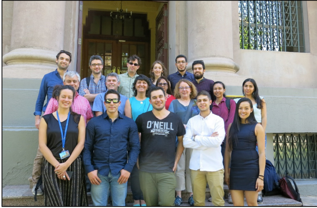
Figure 4. IGCP636 annual meeting 2017: Universidad de Chile, Santiago.

class laboratories. The instruments are used by researchers and students from CEGA, collaborating institutions in Chile, and are also available to the international geothermal community ( http://www.cega.ing.uchile.cl/en/laboratorios/ ). A 2-day field trip was organized to San Jos del Maipo and San Felipe-Los Andes in the Valle de Aconcagua geothermal areas by students and professors from CEGA (Fig. 5). In the first day, sampling of thermal waters was conducted and exhaustive explanations of structural geology were given by students working on those study areas. Groundwater circulating through a fractured rock massif and fault zones could be clearly observed in the second day.