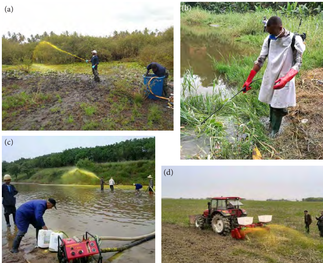
Figure 4. Snail teams applying niclosamide in Zanzibar, United Republic of Tanzania against Bulinus spp. in a Schistosoma haematobium control programme (a), in Cameroon (b) and in Wuhan, China (c, d) against Oncomelania spp. in a Schistosoma japonicum control programme