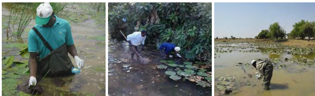
Figure 5. Sampling of aquatic snails

Different approaches are used to check the efficacy of the molluscicide application; while it is possible to determine the concentration of niclosamide in the water (Strufe, 1962), this approach is rarely needed for focal mollusciciding operations where only small amounts of the chemical are periodically applied.