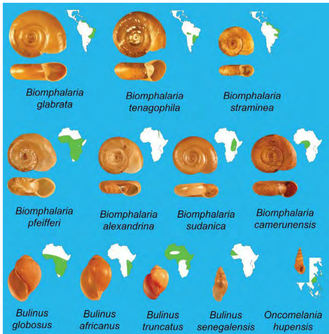
Figure 1. Intermediate snail host species of major global importance (adapted by Dr H Madsen from World Health Organization (1989) slide set: The intermediate snail hosts of African schistosomiasis. Taxonomy, ecology and control)

Snail control also increases awareness of the disease within the community and offers opportunities to reinforce health education interventions alongside preventive chemotherapy.