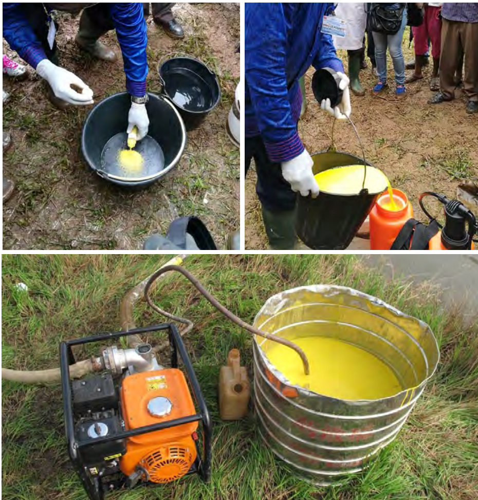
Figure 3. Preparation of molluscicide

Niclosamide toxicity has been assessed by WHO 2 . The 1983 monograph by Andrews et al. (1983) provides extensive information on the chemistry, biology and toxicology of niclosamide as well as its effects on non-targeted plant and animal species. Niclosamide's environmental impacts have been more recently reviewed in a study using niclosamide for