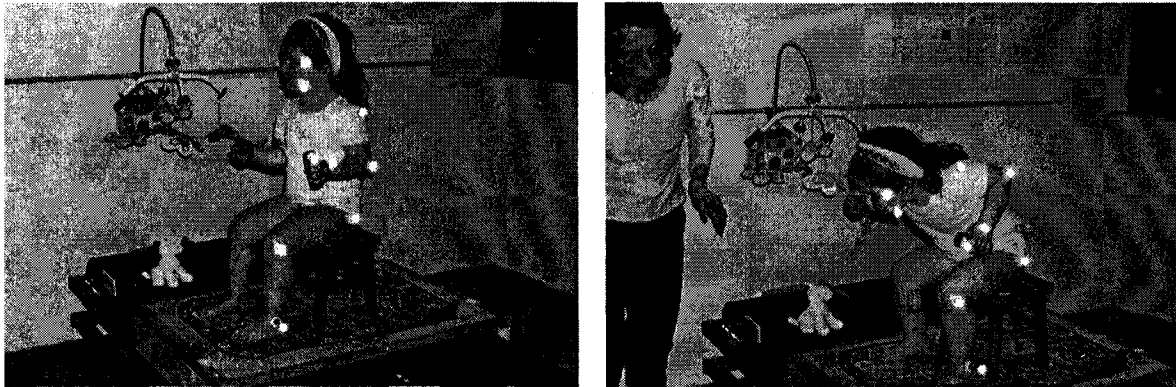
Fig. 3: A 2-year-old child prepares to blow bubbles (left photo) then leans forward to complete the task (right photo). The photo shows the child's use of an egocentric rather than an exocentric reference frame, as she maintains a relatively constant angle between the forearm and the trunk. Little effort is made to orient the forearm (and bottle) to the vertical line of gravity.

calculated an anchoring index between the forearm and trunk angular dispersions (Assaiante, 2000).