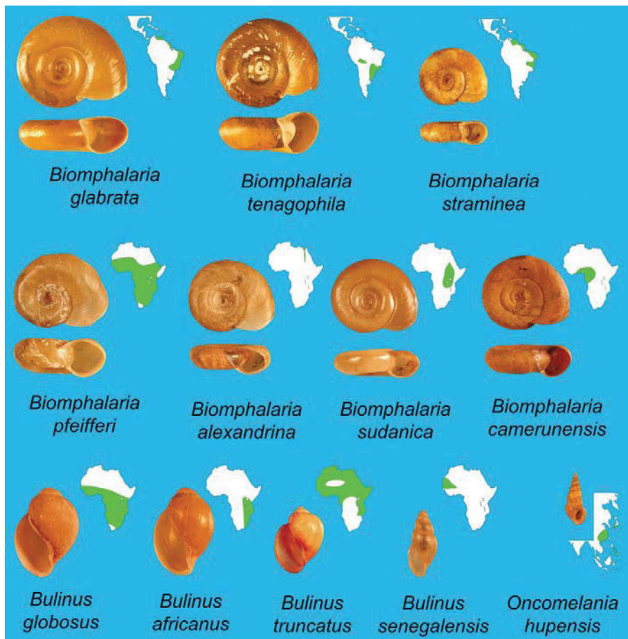
Figure 2.1 Distribution of major intermediate snail host species of major global importance (adapted by Dr H. Madsen from World Health Organization (1989) slide set: The intermediate snail hosts of African schistosomiasis. Taxonomy, ecology and control)

Examples of measurement and conversions are given in Annex 1 and dilution and concentrations are given in Annex 2 .