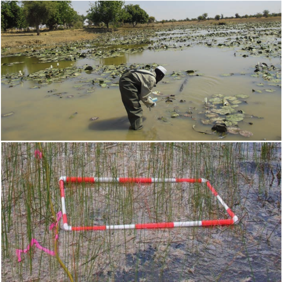
Figure 4.1 Sampling of aquatic snail species in a pond (above); and quadrat sampling of amphibious snail species using a metal frame (below)