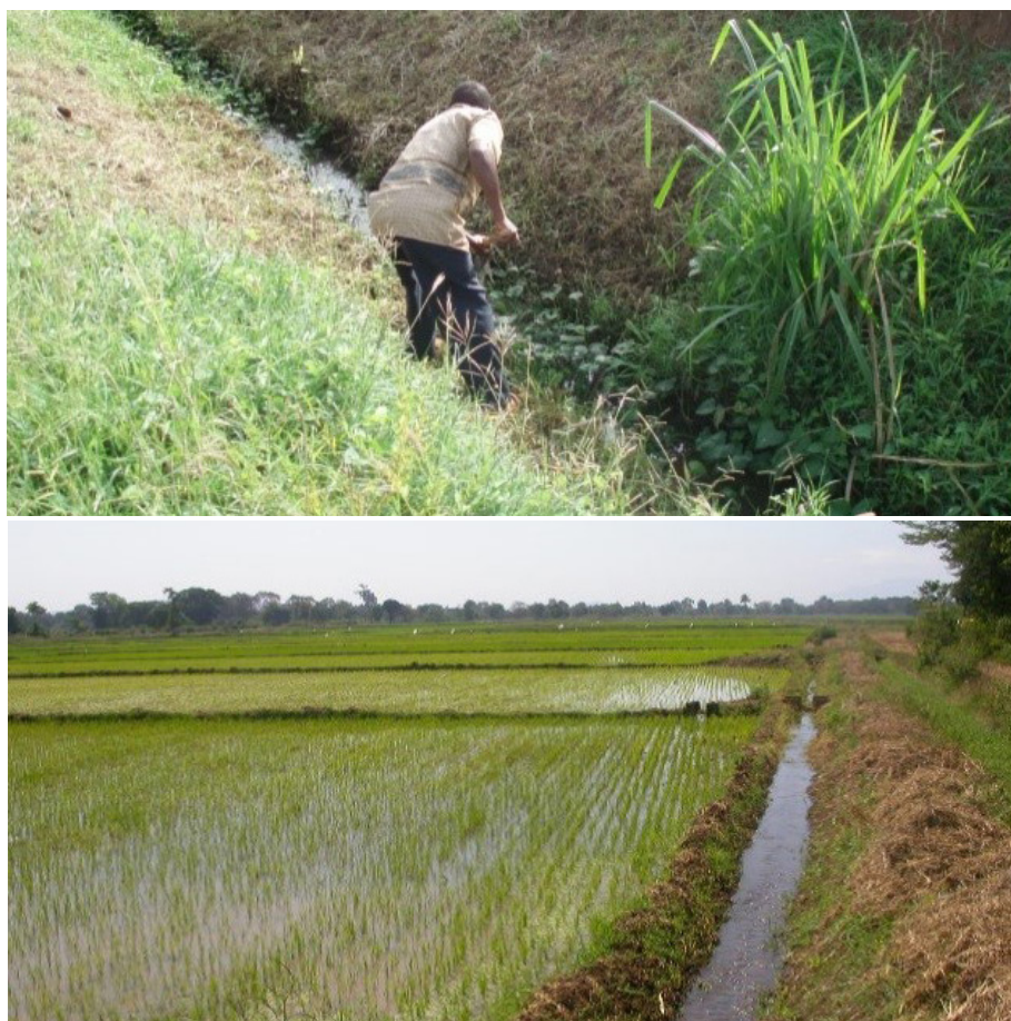
Figure A6.1. A drain (top) and an irrigation canal (below) near Moshi, United Republic of Tanzania

A large-scale molluscicide trial was conducted on a sugar estate near Moshi in the United Republic of Tanzania for the control of aquatic snails Biomphalaria pfeifferi and Bulinus spp. (Crossland, 1963). The test site consisted of five parallel irrigation canals (Figure A6.1) of approximately 1 m wide and 500 m long, with facilities for controlling the flow of water (Fenwick, 1970).