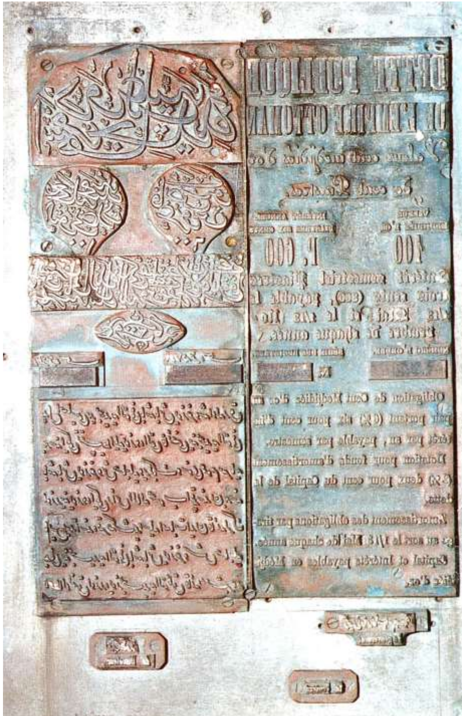
Fig. 6.5. Mold for an Ottoman debenture bond, undated.