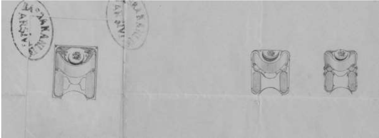
Fig. 6.1. Three drafts of stamps to be used for “authenticated documents.” Each drawing measures about one inch in height. Courtesy of Başbakanlık Osmanlı Arşivi [Prime Ministership Ottoman Archives], Istanbul, i.MMS. 27/1193, #2 (reverse), late B. 1280 [January 1–8, 1864].