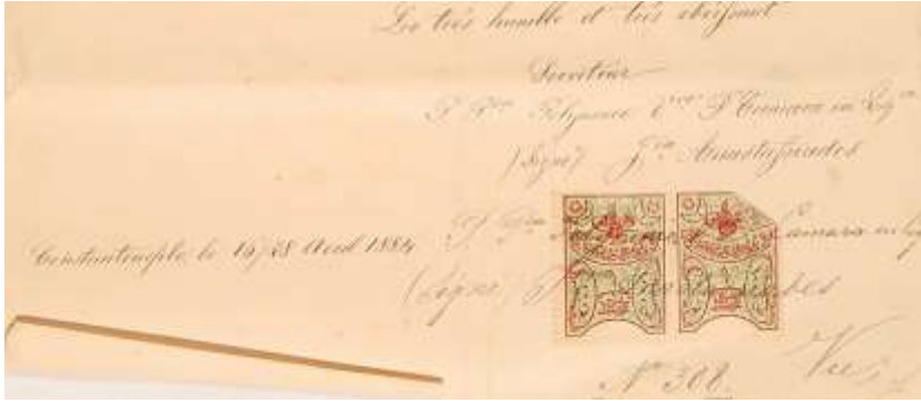
Fig. 6.3. Letter of J. Anastassiades to the consul general of Russia in Istanbul. Courtesy of Başbakanlık Osmanlı Arşivi, İstanbul, ŞD. 2584/12, April 16/28, 1884.