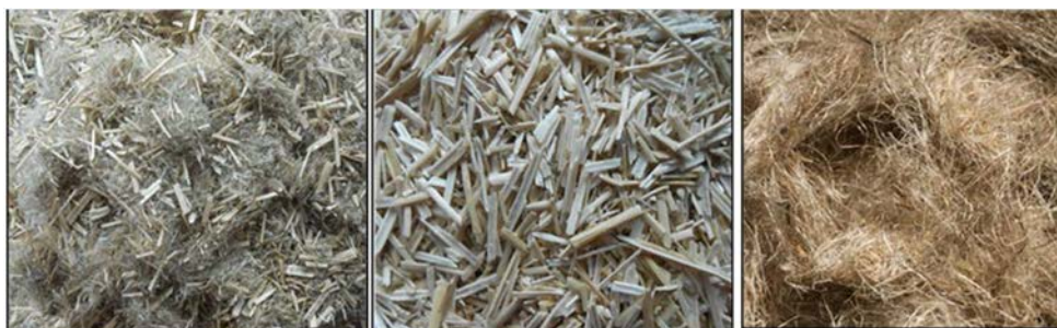
Figure 3 The three vegetal fractions