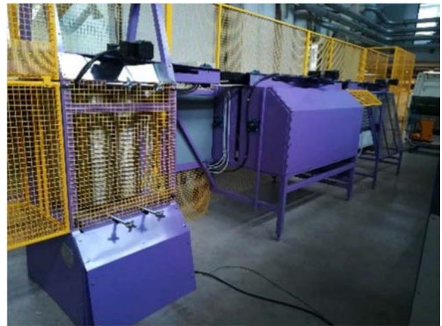
Figure 4 Laboratory scutching/hackling line

A scutching/hackling device is shown in Figure 4. This device is a low scale version of classical industrial scutching/hackling units. It consists of successive breaking, scutching (beating), hackling (combing) units. The scutching and hackling devices are traditionally used when long fibers are expected.