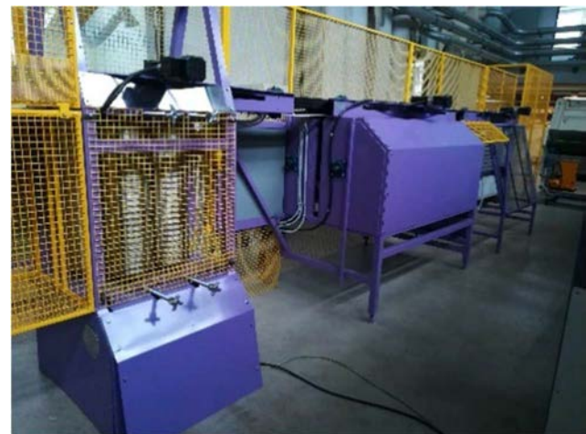
Figure 4 Laboratory scutching/hackling line

A scutching/hackling device is shown in Figure 4. This device is a low scale version of classical industrial scutching/hackling units. It consists of successive breaking, scutching (beating), hackling (combing) units. The scutching and hackling devices are traditionally used when long fibers are expected.