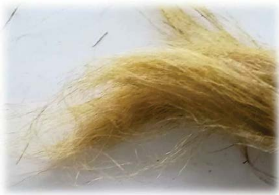
Figure 5 Hackled non-retted linseed flax sliver

If the breaking and scutching steps have an influence on the fiber properties, the most damaging stage is hackling. This stage is particularly important because it finishes the separation of the technical fibers from the rest of the stem components. It also contributes to the finer separation of the fiber bundles into individual fiber or small clusters of fibers.