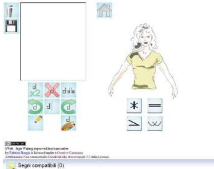
Figure 3. Home screen of SWift.

The application has been designed in strict collaboration with deaf users, according to the core principles of User-Centered ([08]) and Contextual ([09]) design. In particular, we worked with the Team of ISTC-CNR, which includes deaf researchers, who are a true sample of the main target users. As an example, the almost complete absence of textual labels derives from precise needs expressed by them. The redesign of the graphics has been joined with a complete redesign of the logic part of the application. Three areas of SWift interface have the same names and functions as in SignMaker, while the Hint Panel is an innovation.