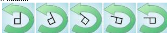
Figure 4. Anti-clockwise rotation button animation.

Buttons in the Toolbox deserved particular attention. Each icon is ‘animated’ by a short sequence triggered by mouseover, mimicking the performed action. Using an animation rather than a clip with a signed sequence requires less space and time resources. An example is in Figure 4, showing screenshots from anti-clockwise rotation button.