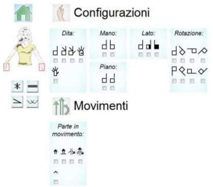
Figure 5. Glyph Menu -Search menu for the hands.

Glyphs corresponding to the current selected criteria are placed into a scrollable panel and are immediately draggable into the Sign Display. Once either a choice is made in any of the Boxes, or a previous one is changed or simply canceled (undo), the system updates the panel by respectively selecting the correct subset from the set of glyphs currently displayed, or by modifying the current set according to the changed feature value. In very lucky cases the user can find the desired glyph by making only one choice. More often, about 3 features must be defined to find the searched glyph.