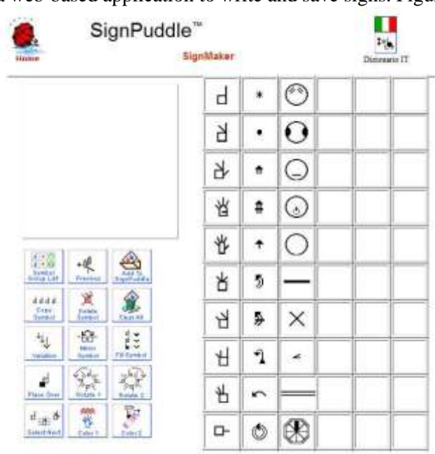
Figure 2. SignMaker's home screen

The aim of Swift is electronic editing in SW. With the same aim, the team of Valerie Sutton has created and developed SignMaker, a web-based application to write and save signs. Figure 2 shows its home screen.