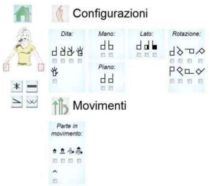
Figure 5. Glyph Menu -Search menu for the hands.

Glyphs corresponding to the current selected criteria are placed into a scrollable panel and are immediately draggable into the Sign Display. Once either a choice is made in any of the Boxes, or a previous one is changed or simply canceled (undo), the system updates the panel by respectively selecting the correct subset from the set of glyphs currently displayed, or by modifying the current set according to the changed feature value. In very lucky cases the user can find the desired glyph by making only one choice. More often, about 3 features must be defined to find the searched glyph.