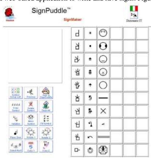
Figure 2. SignMaker's home screen

The aim of Swift is electronic editing in SW. With the same aim, the team of Valerie Sutton has created and developed SignMaker, a web-based application to write and save signs. Figure 2 shows its home screen.