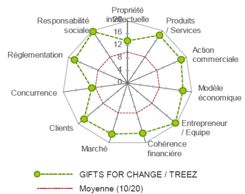
Figure 1 Principal features of the firm “Gifts for Change – Treez”; Source www.wiseed.com h

The study examines the company “Gifts for Change – Treez”. “Gifts for Change- Treez” defines itself as a revolutionary firm in the promotional gifts sector. It specializes in designing and distributing promotional objects and fashion accessories. It was launched in 2014 in Paris and, under the brand Treez, sells in particular trendy bracelets that contribute to reforestation. It is an eco-friendly, commercial firm: for every bracelet sold, a tree is planted as part of a reforestation project somewhere in the world. The firm operates in a market worth more than 1.4 billion euros. It differentiates itself from other players in this highly competitive sector (250 manufacturers/importers of promotional objects, including 4% positioned as “Green”) in various ways: French manufacture, support for reforestation, eco-design and eco-innovation g . Its founder, Alexis Krycève (A.K.) is particularly committed to social and environmental issues and has significant entrepreneurial training and experience. Figure 1 illustrates the main features of the firm “Gifts for Change – Treez”, as gauged by Wiseed contributors.