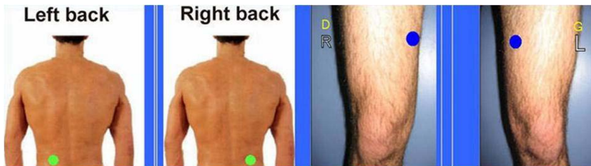
Figure 1: Measurement points at umbilical level (right and left back) and at mid-thigh level using a 5.0 MHz linear array probe.

MHz linear array probe. A probe diameter of 0.75 in (1.90 cm) is the most suitable in terms of positioning, location, orientation, contact, and pressure. We obtained highly reliable, repeated measurements of fat thickness with 2 examiners with an intra-class correlation above 0.97.