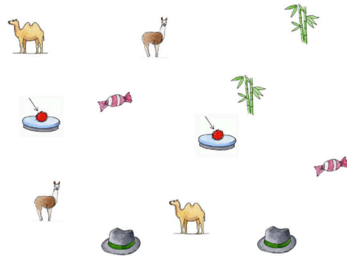
Figure 2: Example of a model participants saw.

make it impossible (the spoken message was perceptible but difficult to understand, 85dB(C)).