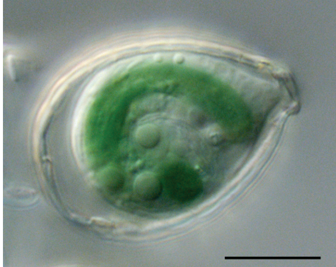
Ponce-Toledo et al., Fig. 2