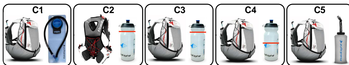
Figure 3: Illustration of the carrying system configurations used for the field test protocol