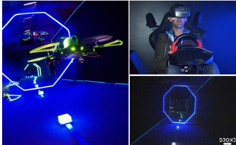
Fig. 2. (Left) A drone located in the immersive environment of Drone Arena. (Right - Top) General setting of a participant. (Right-Bottom) The First Person View (FPS).

participants wore an immersive headset that transmitted, in real time, the images filmed by an onboard camera. The task consisted in finishing a circuit as quickly as possible without crashing the drones. Up to six persons could play at the same time. The duration of the task was about 20 minutes. This experiment was selected to ensure that the total sample would be representative of a homogenous population.