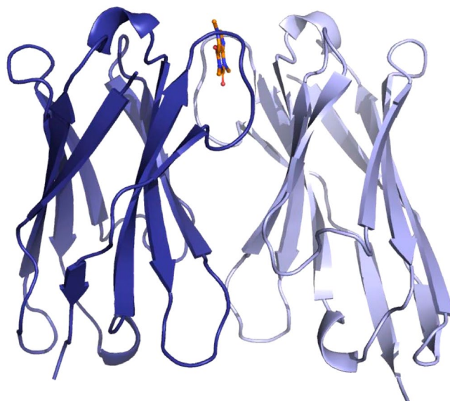
Figure 1. acVHH dimer in complex with caffeine. Cartoon representation of the acVHH dimer x-ray structure. The caffeine is represented as sticks in orange/blue/red.