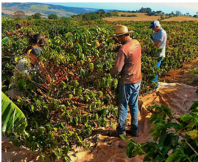
Fig. 1 Family farmers and temporary employees harvesting high-quality coffee in Paraná, South region of Brazil. Coffee production generates income for workers and contributes to the development of the local community.