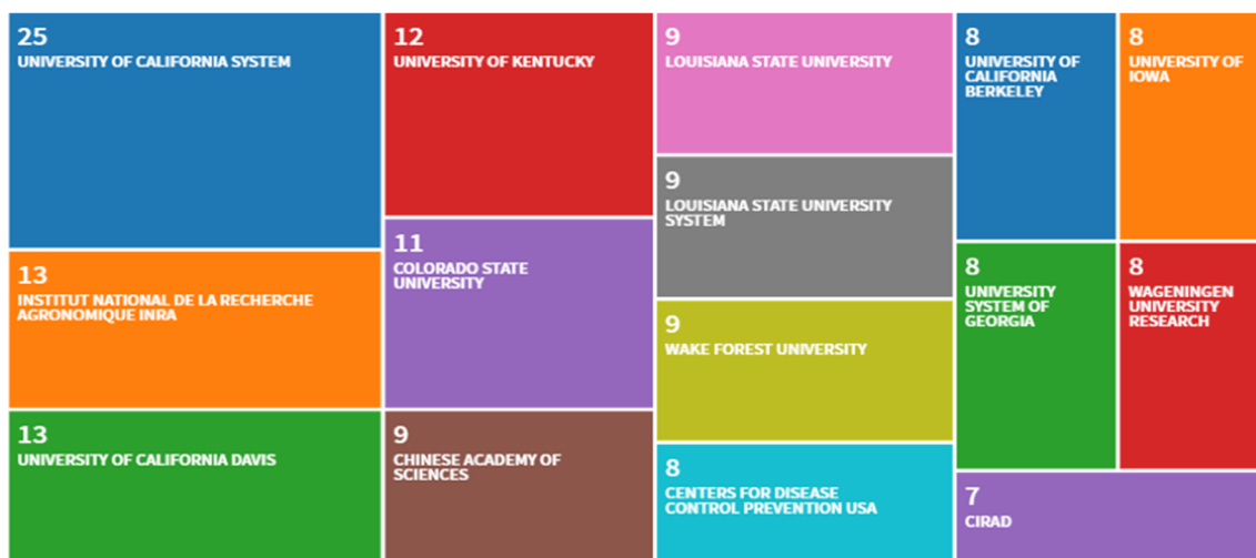
Fig. 3 The top 15 institutions publishing articles on work in agriculture from 2008 to 2018. The size of each rectangle represents the relative number of publications by institution. The number of publications is indicated above the institution's name

authors. Co-author partnership followed two strategies: intra-institution (i.e., same institution but different departments) or inter-institution (i.e., different national or international institutions). Ten of the most productive authors (Table 2) worked in the six universities or research institutes that published the most research on work in agriculture (Fig. 3).