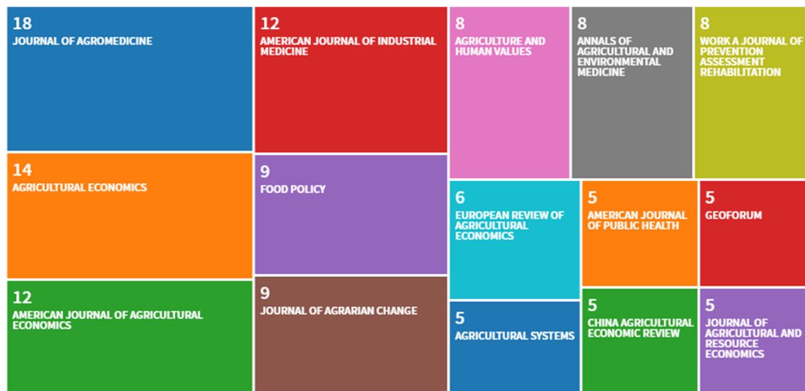
Fig. 4 The top 15 journals publishing articles on work in agriculture from 2008 to 2018. The size of each rectangle represents the relative number of publications by journal. The number of publications is indicated above the journal's title

author about fatal and non-fatal injuries on dairy farms (Doughrte et al. 2013), and the other by J.E. Taylor on migration policy and agricultural labor (Taylor 2010).