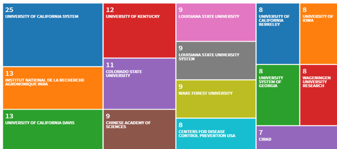
Fig. 3 The top 15 institutions publishing articles on work in agriculture from 2008 to 2018. The size of each rectangle represents the relative number of publications by institution. The number of publications is indicated above the institution's name

authors. Co-author partnership followed two strategies: intra-institution (i.e., same institution but different departments) or inter-institution (i.e., different national or international institutions). Ten of the most productive authors (Table 2) worked in the six universities or research institutes that published the most research on work in agriculture (Fig. 3).