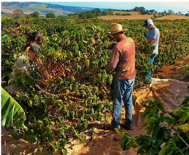
Fig. 1 Family farmers and temporary employees harvesting high-quality coffee in Paraná, South region of Brazil. Coffee production generates income for workers and contributes to the development of the local community.