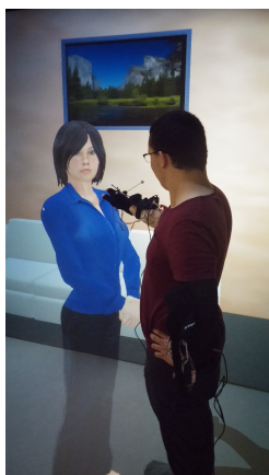
Figure 1: A touch-based human-agent interaction inside the immersive room TRANSLIFE.

Where most of the works we discussed here were focused on either the agent touching the human or the human touching the agent, our work focuses on using a virtual humanoid embodied conversational agent that will be able to both touch and be touched by the user. We will measure the credibility of the interaction throughout the whole interactive loop.