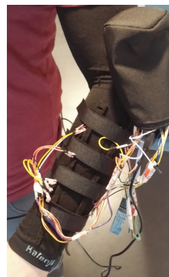
Figure 3: The sleeve prototype.

We will now present the preliminary study conducted to make a first evaluation of the system.