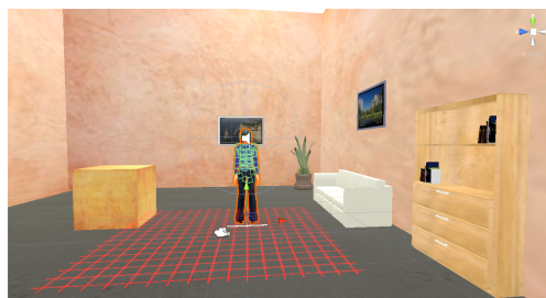
Figure 2: The virtual environment with the agent and its tactile cells (in green).

Basing ourselves on these ideas we gave colliders to the 3D model of our virtual agent to reproduce the principle of Nguyen et al.'s skin receptors. These colliders can be seen in Figure 2. Upon collision with the virtual representation of the hand, we record the cell that was touched but also properties such as the duration of the touch, the initial velocity of the hand when the touch occurred, etc. This is done every time a tactile cell is activated and we can build a sequence of touches that will represent the whole touch gesture.