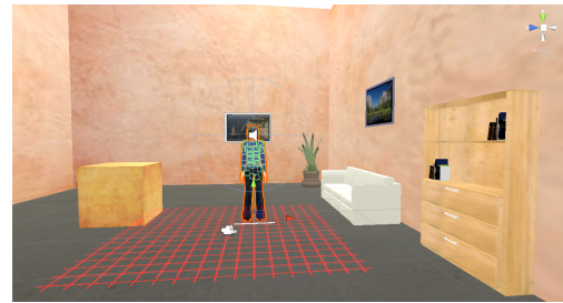
Figure 2: The virtual environment with the agent and its tactile cells (in green).

Basing ourselves on these ideas we gave colliders to the 3D model of our virtual agent to reproduce the principle of Nguyen et al.'s skin receptors. These colliders can be seen in Figure 2. Upon collision with the virtual representation of the hand, we record the cell that was touched but also properties such as the duration of the touch, the initial velocity of the hand when the touch occurred, etc. This is done every time a tactile cell is activated and we can build a sequence of touches that will represent the whole touch gesture.