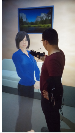
Figure 1: A touch-based human-agent interaction inside the immersive room TRANSLIFE.

Where most of the works we discussed here were focused on either the agent touching the human or the human touching the agent, our work focuses on using a virtual humanoid embodied conversational agent that will be able to both touch and be touched by the user. We will measure the credibility of the interaction throughout the whole interactive loop.