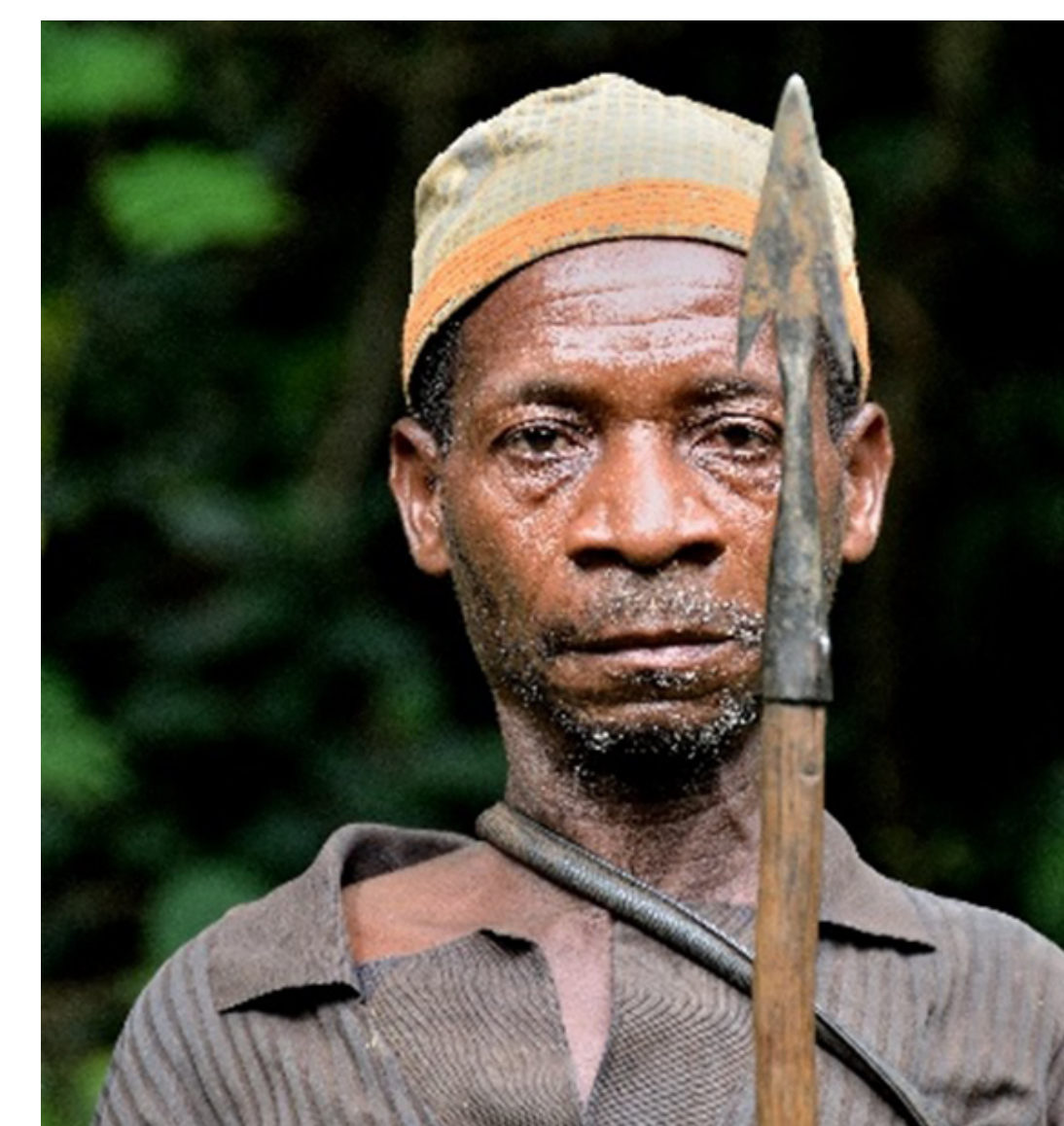
Image 1. Baka Pygmy individual, taken by Dr. Ramirez Rozzi with informed consent from the individual.

The slopes graph represents the increase or decrease of births from one month to the following. We assigned 1 if the number of births increased, -1 if it decreased and 0 if it did not change. When the line is in the negative area, the number of births decrease, and it increases in the positive area. If it crosses the 0 going from negative to positive, it's a minimum, and from positive to negative, it's a maximum. The method was designed to minimize the effect of long term change in birth number over the years fluctuations, by looking only whether birth numbers increase or decrease between months.