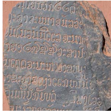
Plate 4: Muang Sing, 15 th -16 th C.