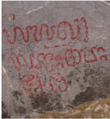
Plate 3: Tham Nang An, 14 th C?