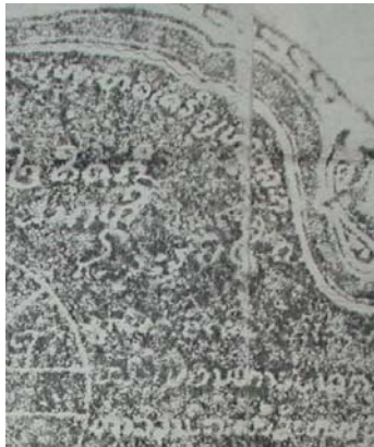
Plate 5: Tha Khek, 15 th C.