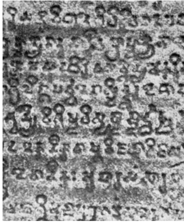
Plate 1: Vat Luang Kao, 5 th C.