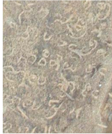
Plate 2: Ban Tha Lat, 8 th C.