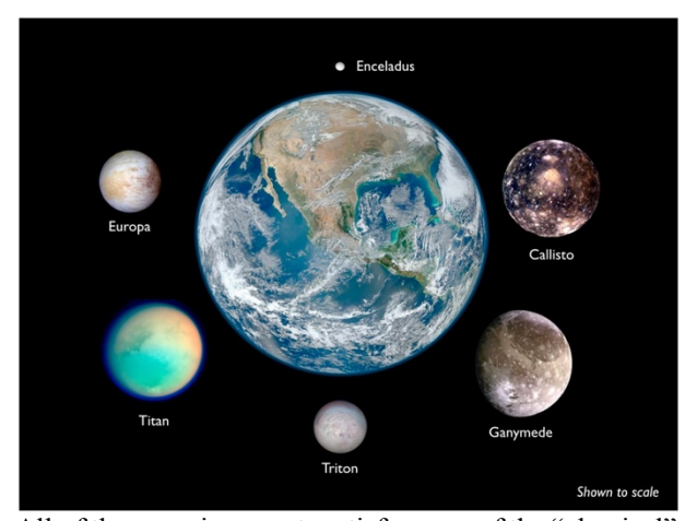
All of these environments satisfy many of the "classical" criteria for habitability (liquid water, energy sources to

The satellites of Jupiter and Saturn have been revealed as extremely astrobiologically interesting bodies presenting promising conditions for habitability and the development and/or maintenance of life. Titan and Enceladus, Saturn's satellites, were found by the Cassini-Huygens mission to possess active organic chemistries with seasonal variations, unique geological features and possibly internal liquid water oceans, among other. Additionally, Jupiter's Europa and Ganymede show indications of harboring liquid water oceans under their icy crusts, which may be in direct contact with a silicate mantle floor and kept warm through time by tidally generated heat (Fig. 1).