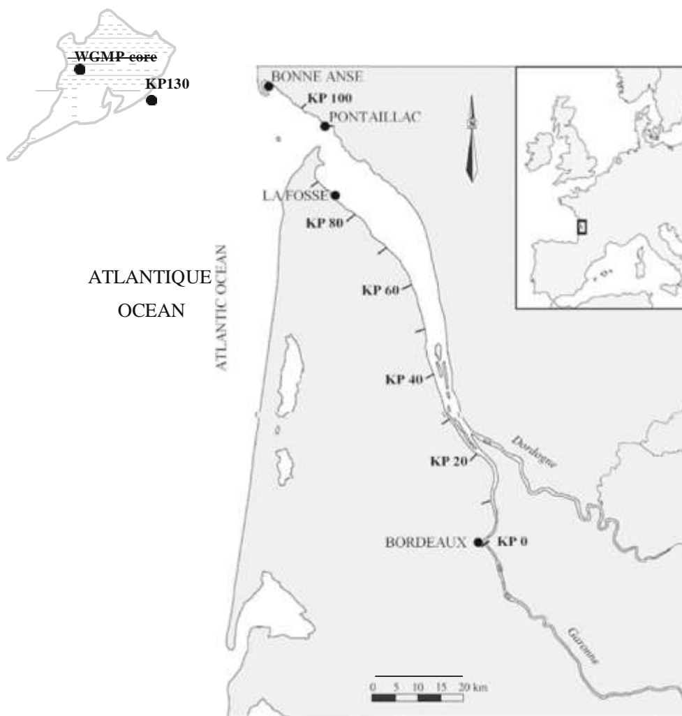
Fig. 1 Map of the Gironde Estuary, South West France. Kilometric point (KP): distance (kilometre) from Bordeaux. The core in the West Gironde Mud Patch (WGMP; grey dashed area) is described in Schmidt et al. (2005)

located in the low salinity ( S ) region and migrates up and down estuary as a function of both tidal currents and seasonal river flow variations (Sottolichio and Castaing 1999). Typical water and particle residence times were estimated at ~20–90 days and ~1–2 years respectively, depending on the season (Jouanneau and Latouche 1981).