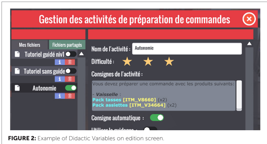
FIGURE 2: Example of Didactic Variables on edition screen.

tasks like navigating or mimicking real gesture. That is why we have focused some of our proposals on time saving and autonomy like tools proposed by Freitag and Weyers (2018).