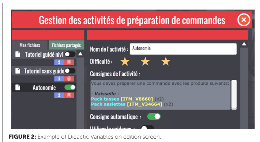
FIGURE 2: Example of Didactic Variables on edition screen.

tasks like navigating or mimicking real gesture. That is why we have focused some of our proposals on time saving and autonomy like tools proposed by Freitag and Weyers (2018).