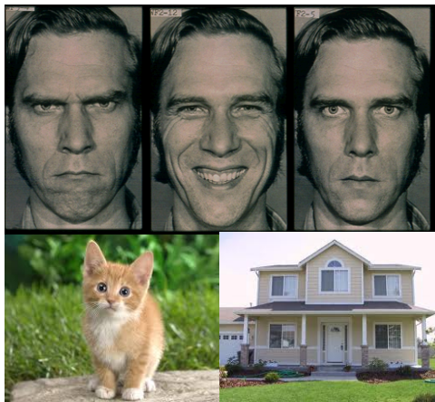
Figure 1. Examples of facial and control stimuli

Participants engaged in a free-viewing eye-tracking task, looking at images of Caucasian men displaying angry , happy , & neutral facial expressions and control images including animate and inanimate stimuli.