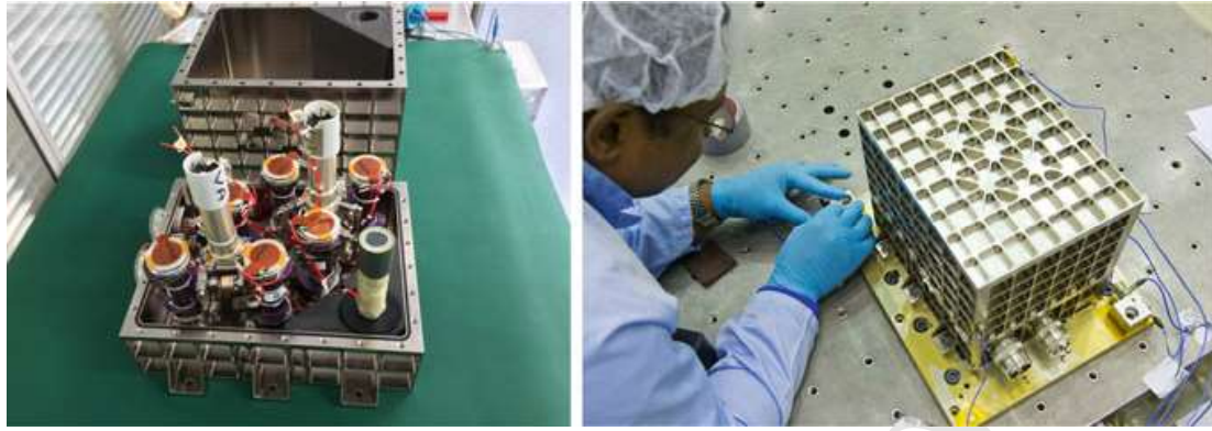
Fig. 2 Left: The six HP cells contained in the C-box. Right: The C-box once closed

304 Table 1 summarizes the composition and pressures used in the six different experi- 305 mental HP cells. Pressures correspond to the in-flight average temperature of 50.8 °C 306 at which experiments were performed, as further elucidated in Sect. 2 of Chap. 3. 307 The fluids in HP cells A–D are in a compressed liquid state, while HP cells E and F 308 contain compressed gas, which on lowering the pressure produces a small amount 309 of liquid. The latter mimics an important class of fluids of interest to the oil and gas 310 industry, namely gas condensate, which is monophasic in reservoir conditions but 311 diphasic (gas + “condensate”, i.e. liquid) at atmospheric conditions. Preparation and 312 injection of the fluids mixture inside the HP cells have been performed in the State 313 Key Laboratory of Enhanced Oil Recovery of the Research Institute of Petroleum 314 Exploration & Development in Beijing as described in Sect. 1 of Chap. 3.