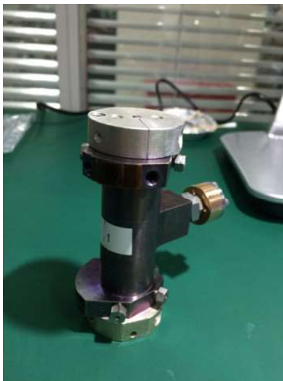
Fig. 1 One of the HP cells flown in SJ10 before integration in its triad and in the C-Box. Note the two aluminium blocks attached at the titanium end parts

283 of an individual cell can be found in Ref. [23]. Electrical heaters are placed at the 284 two end aluminium blocks and the HP cells, thus fashioned, are attached to two 285 supporting triads and integrated into a hermetically sealed aluminium crate, named 286 C-box, see Fig. 2, which also contains the electronics for temperature control and 287 communications. During the orbital flight the two aluminium blocks of every HP cell 288 were maintained at different temperatures, so as to induce thermodiffusion inside the 289 fluid contained therein. Pt100 sensors with accuracy standard uncertainty of 0.05 K 290 placed at the two ends of each HP cell are used to monitor temperatures through the 291 duration of the experiment. Time-stamped temperature readings are stored in a flash 292 disk also contained in the C-Box. At the end of the experiment the central valves 293 in all HP cells were closed shut separating each fluid sample into two fractions (a 294 “hot” and a “cold” part), which, once recovered after re-entry, were forwarded to the 295 State Key Laboratory of Enhanced Oil Recovery (Research Institute of Petroleum 296 Exploration & Development) for composition analysis. The set-up is similar to the 297 one used during the Foton-M3 mission in 2007 and further details can be found 298 elsewhere [9, 21].