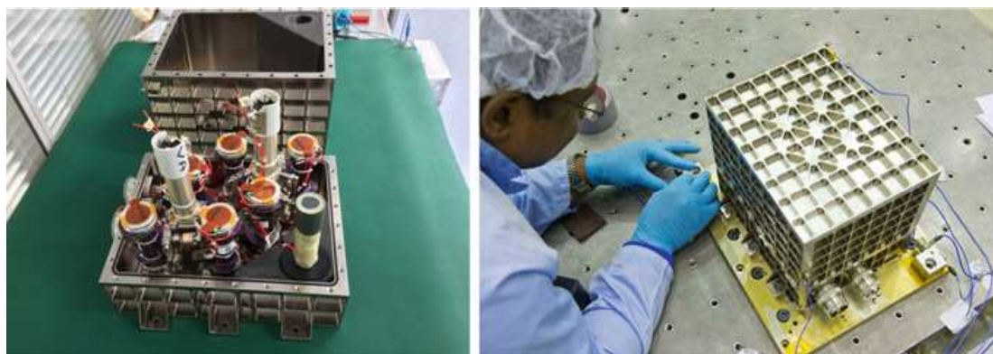
Fig. 2 Left: The six HP cells contained in the C-box. Right: The C-box once closed

304 Table 1 summarizes the composition and pressures used in the six different experi- 305 mental HP cells. Pressures correspond to the in-flight average temperature of 50.8 °C 306 at which experiments were performed, as further elucidated in Sect. 2 of Chap. 3. 307 The fluids in HP cells A–D are in a compressed liquid state, while HP cells E and F 308 contain compressed gas, which on lowering the pressure produces a small amount 309 of liquid. The latter mimics an important class of fluids of interest to the oil and gas 310 industry, namely gas condensate, which is monophasic in reservoir conditions but 311 diphasic (gas + “condensate”, i.e. liquid) at atmospheric conditions. Preparation and 312 injection of the fluids mixture inside the HP cells have been performed in the State 313 Key Laboratory of Enhanced Oil Recovery of the Research Institute of Petroleum 314 Exploration & Development in Beijing as described in Sect. 1 of Chap. 3.