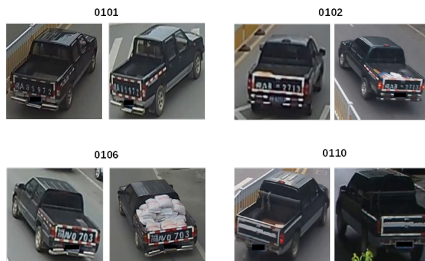
Figure 1. Examples of similar vehicles with their identity numbers in VeRi-776 dataset [19]. These pickup trucks have almost identical model and color, which makes vehicle Re-ID extremely challenging. One possible solution is to extract more discriminative local features from distinct regions.

License plate number is naturally the most crucial information for people to recognize a vehicle, which has been widely applied in real-world traffic flow analysis systems. However, due to low resolution cameras, occlusions