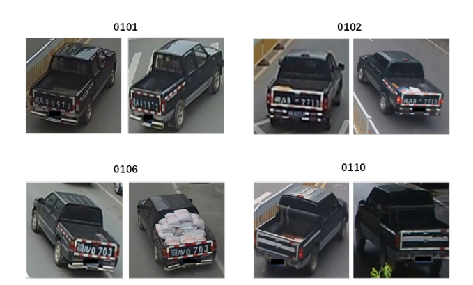
Figure 1. Examples of similar vehicles with their identity numbers in VeRi-776 dataset [19]. These pickup trunks have almost identical model and color, which makes vehicle Re-ID extremely challenging. One possible solution is to extract more discriminative local features from distinct regions.

License plate number is naturally the most crucial information for people to recognize a vehicle, which has been widely applied in real-world traffic flow analysis systems. However, due to low resolution cameras, occlusions