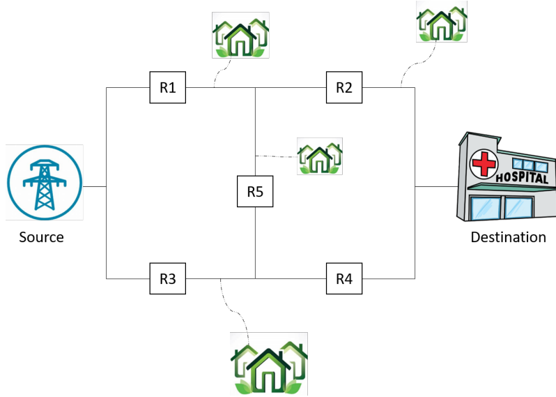
Figure 1: Power distribution layout

necessary or buying very reliable ones or both. The objective is to find the reliability of each component and how many of each component should be coupled in parallel. I test simulated annealing and particle swarm optimization implementations to meet the aforementioned objective. I also explore the bi-objective approach in order to find the efficient Pareto frontier for the cost minimization and reliability maximization.