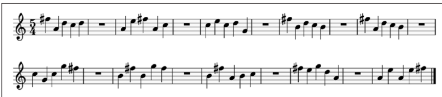
Figure A2. Music notation of the stimuli used in the Melody Production test.