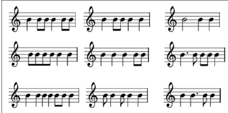
Figure A1. Music notation of the stimuli used in the Rhythm Production test.