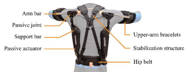
Figure 1: Description of the PAEXO exoskeleton.

The exoskeleton evaluated in this work is PAEXO developed by Ottobock SE & Co. KGaA together with Volkswagen AG commercialized (Bornmann, et al. 2016). PAEXO is a lightweight (1.8 kg) passive exoskeleton that provides a support torque to the user's arms, by transferring an adjustable portion of the arm weight to a hip belt via a passive actuator (Fig. 1).