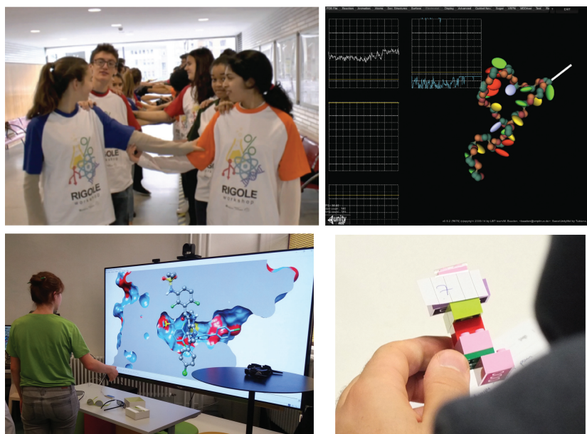
Figure 4: top left: human folding activity, top right: interactive RNA folding simulation on the computer, bottom left: interactive docking (for high school students in 2018), bottom right: example of lego structure used in the computer science module.

After the game, lasting usually about 20 minutes, students start working at the computer lab using the UnityMol [28] software and entering the HiRE-RNA folding competition [29] (Fig. 4). The software performs a molecular dynamics simulation using a simplified, coarse-grained representation for nucleic acids, which is visualized in real time on the computer screen. By selecting a particle of the system it is possible to apply an external pulling force, which is integrated in the Newtonian dynamics, allowing the user to pull the molecule toward a desired conformation 2 . Pop-up graphs monitor different energy terms from which one can deduce, for example, when a base pair is formed. Students first familiarize themselves with the software performing simple interactive simulation tasks on the DNA double helix, such as unwinding a preformed helix. Then they have to solve four RNA folding puzzles with increasing complexity, from hairpins, to a pseudoknot, to a triple helix, starting from a completely unfolded configuration. By observing the