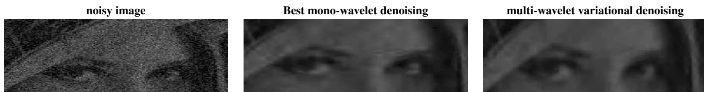
Fig. 2. Comparison of the multi-wavelet variational denoising to the best mono-wavelet denoising for “lena” corrupted by a Gaussian additive noise with a standard deviation set to 40. We display a zoom on the area around the eyes.