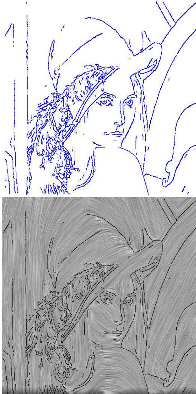
Fig. 2. Interpolation with the curvature operator on Lena. The initialization is orthogonal to the gradient orientation field decimated using a Canny-Deriche filter. A general observation is that T-junctions are preserved.