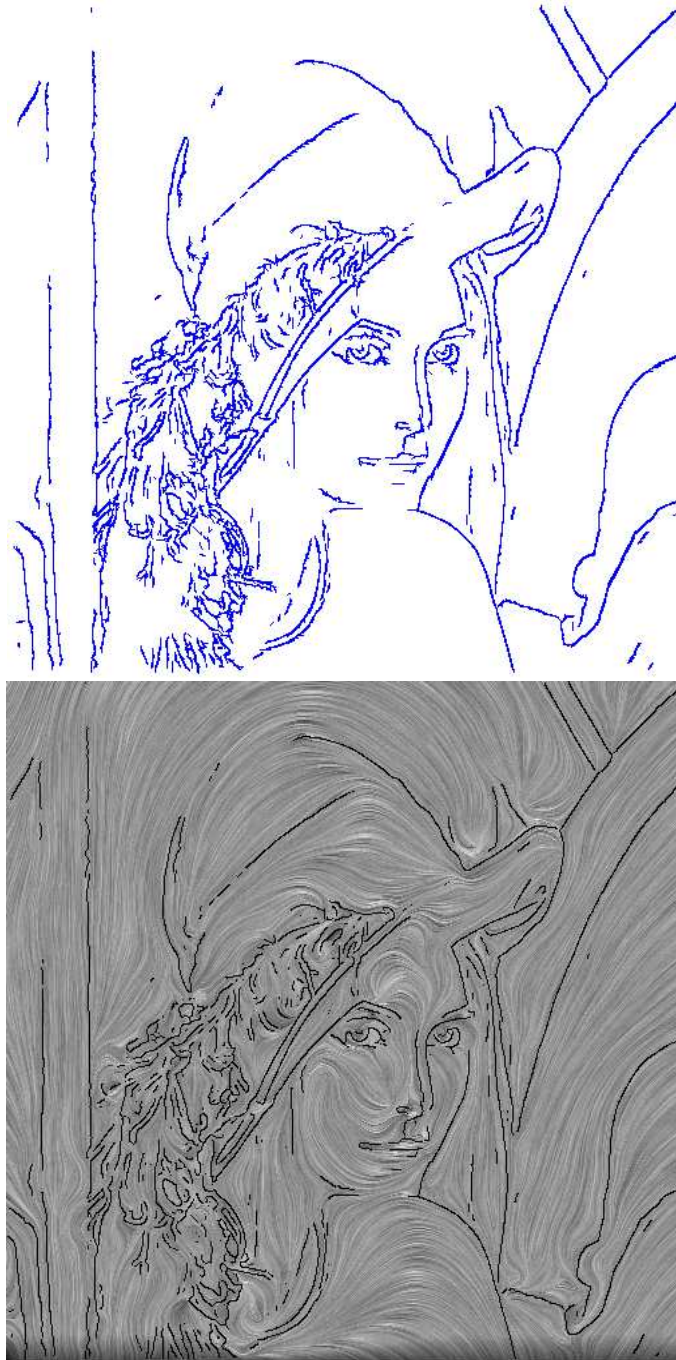
Fig. 4. Test with the Lena image, initialised with the orthogonal to the gradient orientation field decimated using a Canny-Deriche filter. Notice that the recovered field is tangent to the edges, in particular at the top of the hat, on the strands of hair around the face and on Lena's jaw and chin.